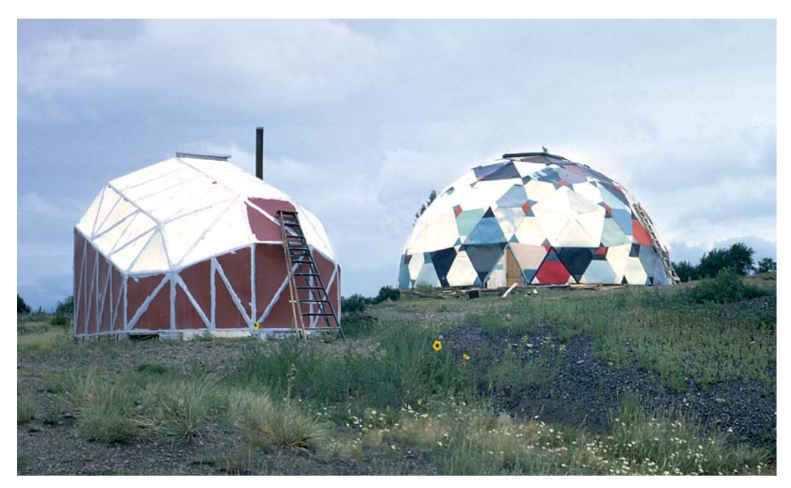
Cartop Dome and Theater at Drop City, the utopian community built in southern Colorado in the mid-1960s.

But it is clear, not least from the 1996 report "Weather as a Force Multiplier: Owning the Weather in 2025"—one "chapter" of the multi-volume study Air Force 2025 that was commissioned by the US Air Force Chief of Staff to speculate on the future of air war over a thirty-year period—that the story doesn't end there. Significantly, this report is concerned not just to set out what might be technologically possible, but also to project political scenarios in which it could become so, thus placing the question of international treaties and public opinion to the fore. What is striking here is that our contemporary environmental crisis is imagined not as a constraint to, but a lubricant of, acceptability whereby civil concerns drive cultural and technological developments to the advantage of the military. In the narrative constructed by the authors, the demands of globalized business lead to the ever-greater refinement of weather observation and prediction mechanisms. Against this background, the world experiences what are increasingly intolerable stresses resulting from population pressures and environmental degradation (shortages of water, food, etc.). As the report puts it: "Massive life and property losses associated with natural weather disasters become increasingly unacceptable. These pressures prompt governments and/or other organizations who are able to capitalize on the technological advances of the previous 20 years to pursue a highly