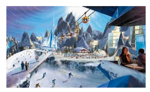
Promotional image from the indefinitely postponed Sunny Mountain Ski Dome project, Dubai.

The ski dome, although structurally dissimilar, is an afterimage of Buckminster Fuller's geodesics with all their complex connotations of autonomy, encapsulation, and world imagery—expressed most potently in the floating globes of Fuller and Shoji Sadao's "Cloud Nine" project (ca. 1960). Now, a recurring notion within the political history of air-conditioning, in which Fuller's work participates, is that of weather control as a remedial activity. It is almost as if weather—at least in the imagination of northern white males—is alienation, or at least is a fundamental expression thereof, and that to make reparation, to get back together again, to melt the ice in whatever way we mean (with one another, with