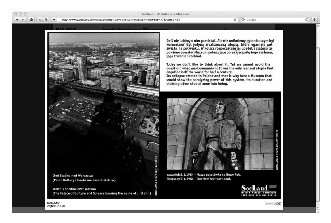
Figure 5. 'Stalin's shadow over Warsaw' (www.socland.pl).

shadow on the photograph that we have just discussed. Notably the project's plan at street level is drawn without shadows, save for that of a headless figure who lies flat, the upper part of the torso and (again) raised arm passing above an area of glazing that gives light to a pit into which the head has fallen or been cast (Fig. 6). It is as if the shadow of the Palace has been gathered into the form of a figure; or, more specifically, that the shadow has become concretised into a totemic image of Stalin (the Minotaur and his fingerprint/labyrinth, to gesture back to Komar and Melamid), which is then 'executed'.