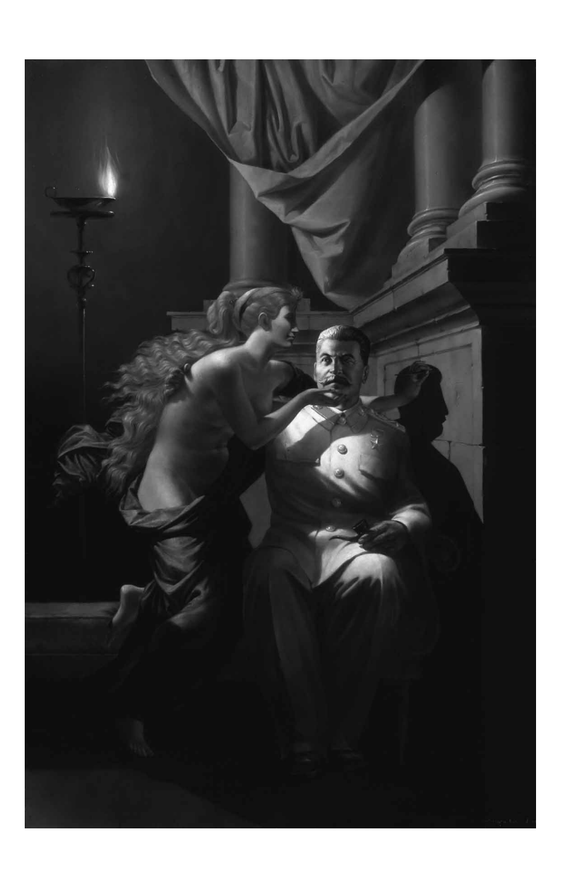
Figure 4. Komar and Melamid, The Origin of Socialist Realism (1982–3), oil on canvas, 72 x 48 inches.