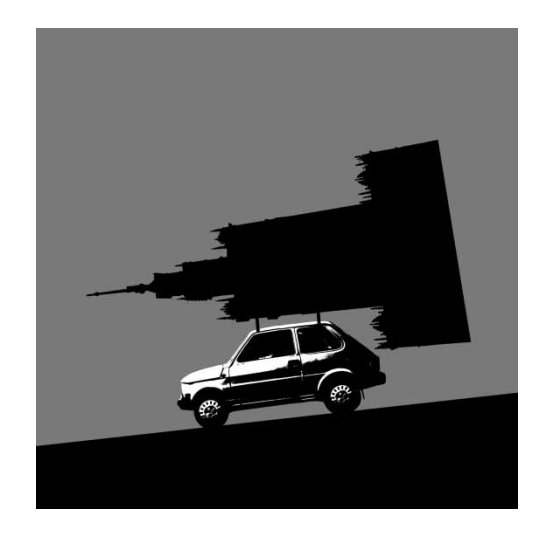
Figure 1. Karolina Breguła, from All I Can See is the Palace (2005).

In the shops of Warsaw art galleries drinking mugs and T-shirts are sold upon which a striking image is printed (Fig. 1). Aimed at tourists to the city, the products show a car in profile, pointing to the left, as if it is about to drive off. Resting awkwardly on top of the car is a large form, bulky and rectilinear at one end, but tapering through stages to develop into a needle-like point that then projects over the bonnet of the vehicle below. To someone unfamiliar with Warsaw, the ungainly over-sized mass on top of the car looks like a kind of retrostyled rocket attachment, something that might have been knocked up from available materials in a local inventor's kitchen, pieced together and then wheeled out, strapped to the roof of the 'Mały Fiat'—a model manufactured in Poland by Fiat in the 1970s—on which it sits. But for anyone who has even the most passing acquaintance with the city, the shape is instantly recognisable as that of the Palace of Culture and Science (PKiN), the gargantuan structure that was gifted to Warsaw by Stalin and that has, ever since its opening in 1955, remained the contemporary city's most unrelenting and difficult physical inheritance. The joke here is that the Palace becomes, like the goods on which its image is printed, carried away as a tourist memento. At the same time, however, the image points towards, and in some respects trades upon, the difficulty of 'reducing' the Palace in this way.