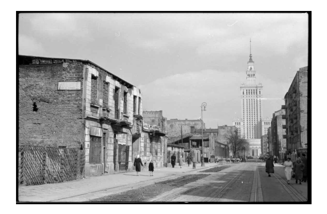
Figure 2. Palace of Culture and Science, 1956.

Nasonov—who had also worked on the university project.<sup>20</sup> But more than this, it also pointed, as did the Moscow buildings themselves, to the virtual centrepiece to which the latter were referred, the never-to-be-completed project for the Palace of Soviets, the immense edifice whose design has been described as 'the prototype for all Stalinist architecture'.<sup>21</sup>